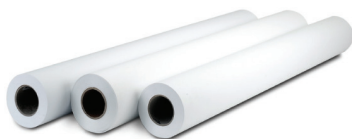
HP Backlit Polyester Film