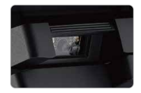
2D Barcode Scanner

Dressed from head to toe in timeless black or white color, the only trend that never goes out of style, and with stylish touches added throughout, the HS-3500 Series is not just a piece of machinery, it is an elegantly crafted piece of art that looks right at home in any store decoration.