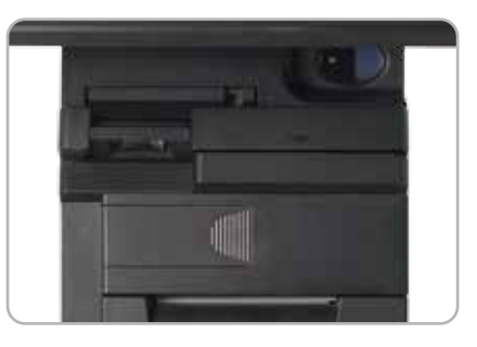
Optional Built-in MSR Fingerprint Sensor and RFID Reader