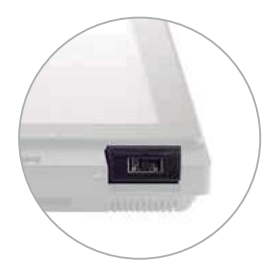
Optional Built-in 2D Barcode Scanner